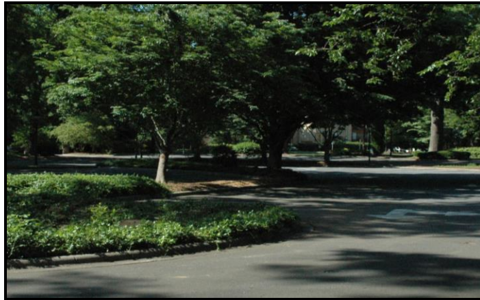
Figure 12.11-2: Example of parking lot broken up by landscaping.

12.11-2 Limitation on Uninterrupted Areas of Parking. Uninterrupted areas of parking lot shall be limited in size. Large parking lots shall be broken by buildings and/or landscape features. See Figure 12.11-2 below: